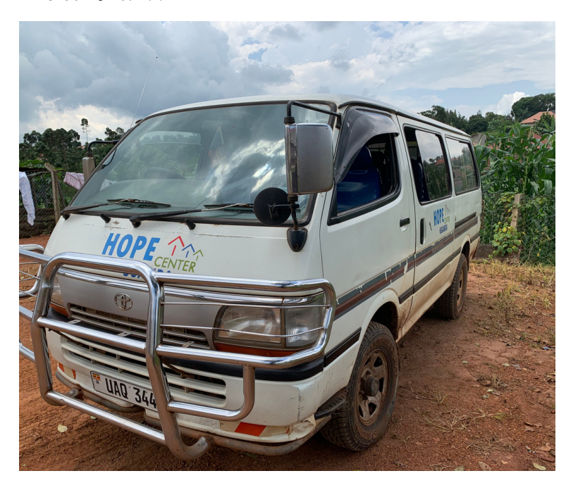
Estimated costs for this project:

The estimated cost to complete this project from start to finish is $14,000